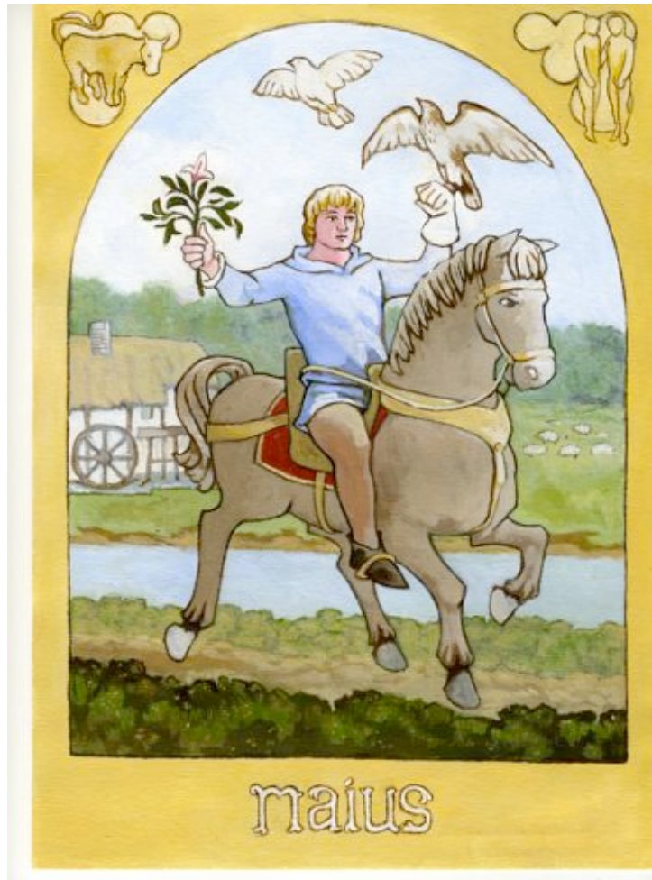
14. 'May' from a series still to be completed