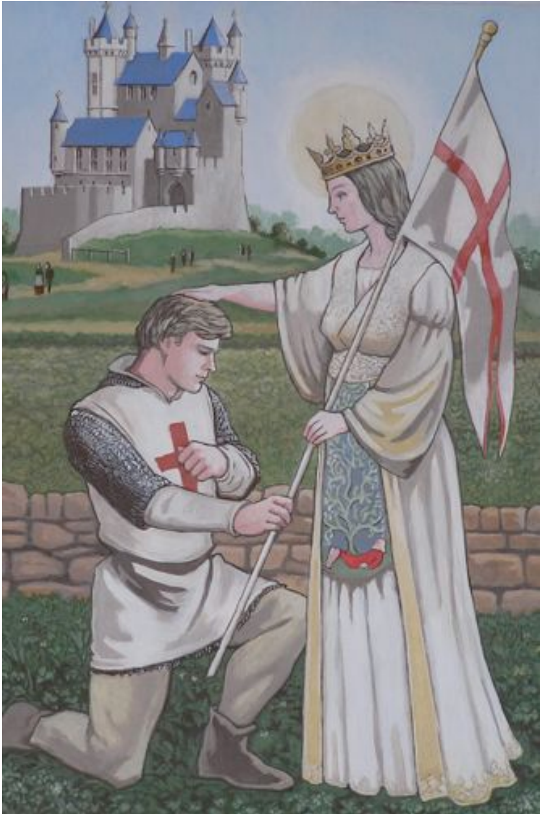
7. St George - the Virgin's champion (2009)