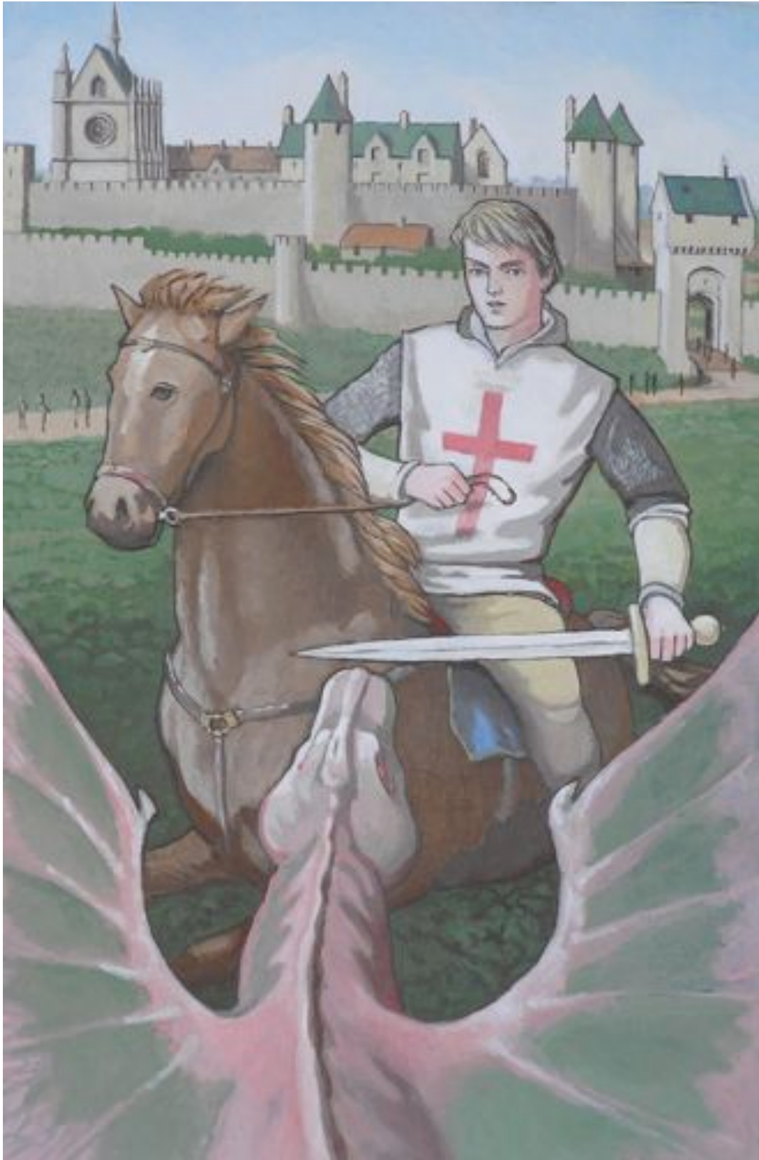
8. St George - fighting the dragon (2009)