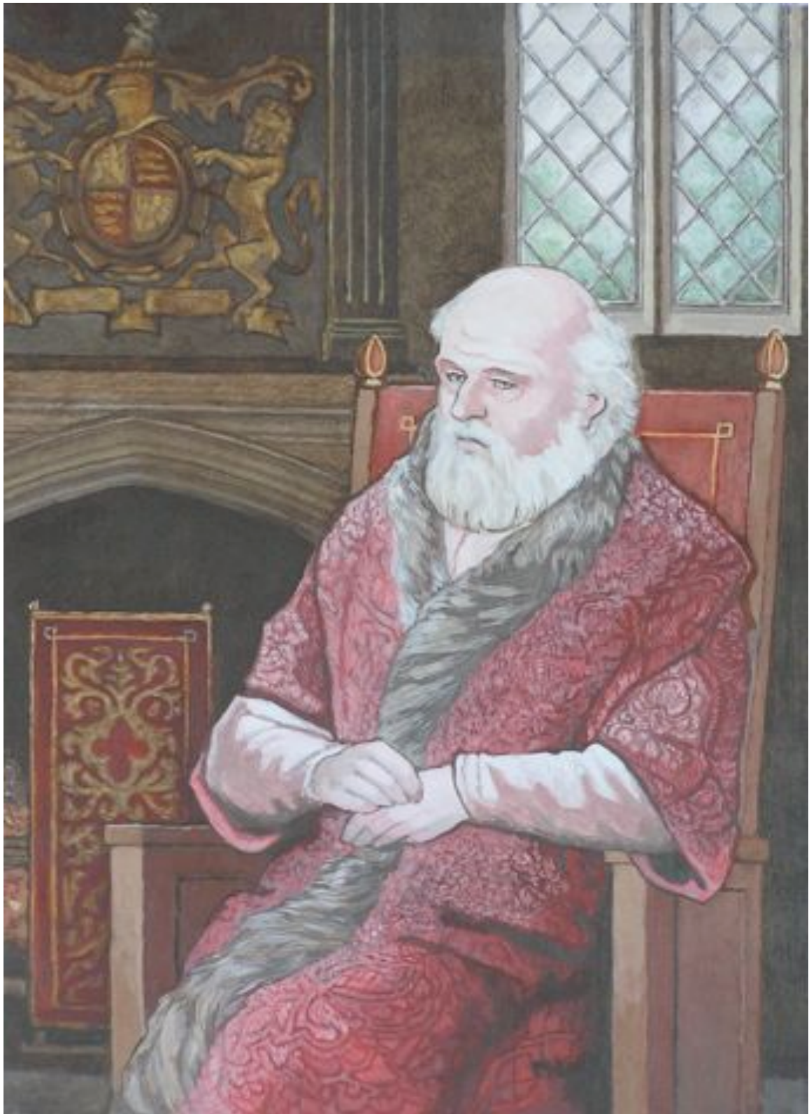
4. Winter (2008)

thought of as young woman, her arms full of flowers, walking through sun-filled woodland (6). A similar series based on the calendar months is planned (13).