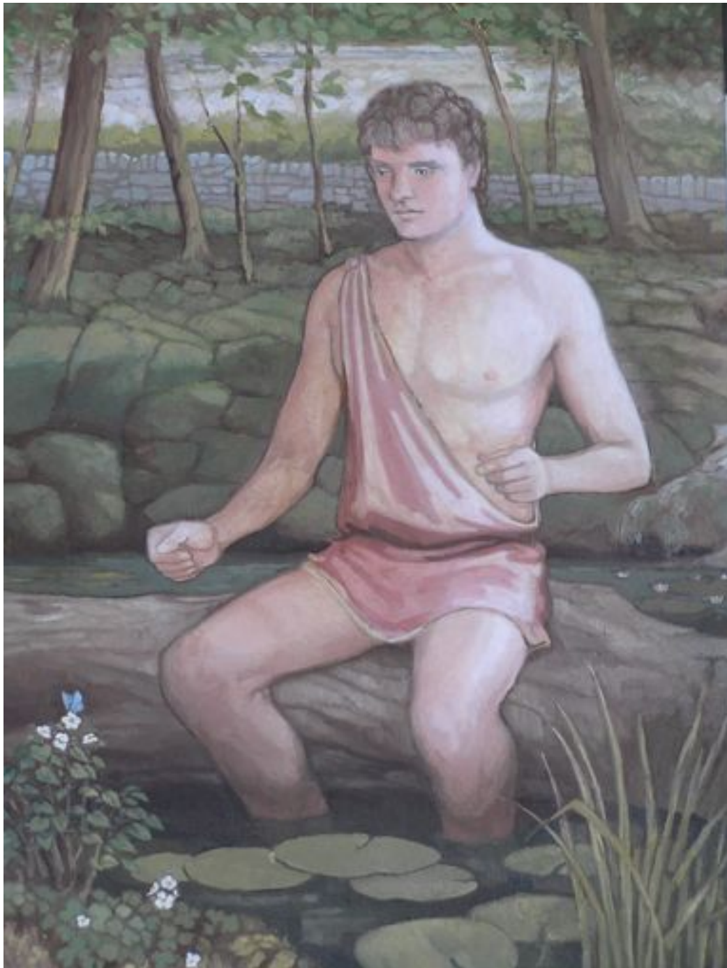
2. Daphnis (2008)

upon Daphnis for the first time with the eyes of love, although he is unaware of it and she can't give a name to what she feels. 'I'm in pain and I've not been injured,' she says, 'I'm burning hot yet here I am sitting in the shade...' For the time being Daphnis' gaze is fixed upon a blue butterfly whose transient beauty echoes his own but soon he will experience the same longing that she does. Rarely have the pangs of teenage love been described more delicately: 'they wanted something but they did not know what they wanted...' Many obstacles are placed in the way of the lovers before they finally make their nuptial vows but all ends happily and not just on the wedding night.